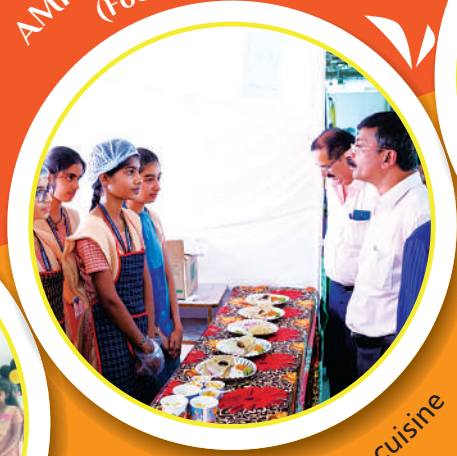
Bringing class to cuisine

A hugely enjoyable activity, this food fest introduces students to a wide variety of cuisines and the aesthetics of the culinary arts.