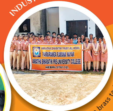
Getting down to brass tacks

Grooming students to become accomplished professionals by introducing them to the ground realities of the industrial world and having interactions with industry experts and corporate leaders.