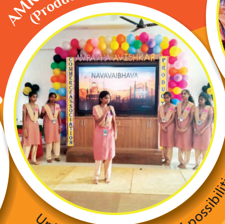
Unleashing the power of possibilities

This activity involves the presentation of product launching strategies and techniques for an innovative product. It stimulates creativity and technical presentation skills.