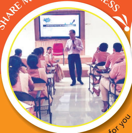
Making money work for you

We conduct workshops in order to create awareness about basic share market technologies. Live operations of BSE are displayed.